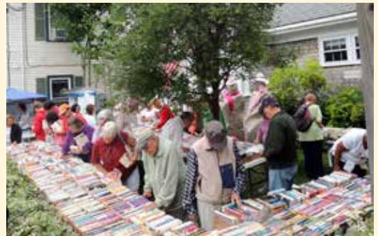
Paperback book sale during July