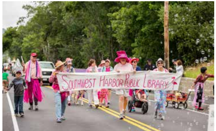
The Library marches in the Flamingo Parade