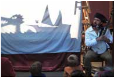
Captain McFiniginigan shadow puppet show