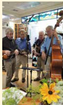
Quartet provides lively entertainment at the art auction opening