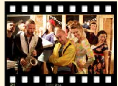
Barn Arts Collective

Summer Reading Showtime filming sessions will take place on Wednesday evenings in July and August, with the culminating red-carpet premiere event in mid August. Exact dates will be available on the SWHPL website. If you would like to learn more about the program or are interested in helping out, please email me at literacycoordinator01@gmail.com.