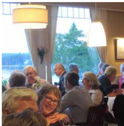
Guests enjoy conversation and a beautiful view at the Claremont Hotel Dinner