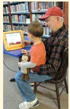
Technology explored by two generations