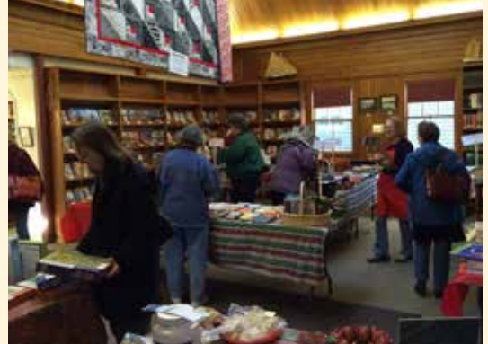
Shopping at the holiday book sale