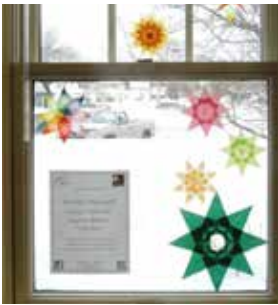
Window stars made during Women's History Workshop