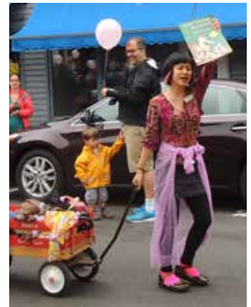
Books and reading are always a popular parade theme