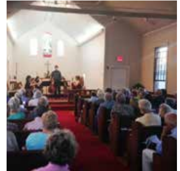
Kneisel Hall performs to a full house