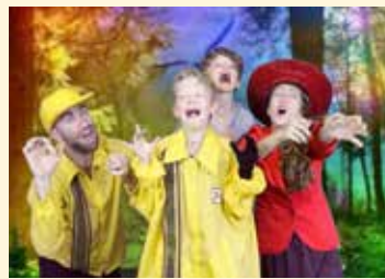
Summer Reading Showtime "The Rainbow Goblins"

This year, we aim to increase the impact and reach of the program by adding filming sessions, providing DVD's of the final film for local schools to share with their students, and creating a short documentary about the program to share with libraries state-wide. Through Summer Reading Showtime I have experienced first-hand the strength of the link between literacy and the performing arts, and I hope that our program inspires literacy improvement in other communities as well.