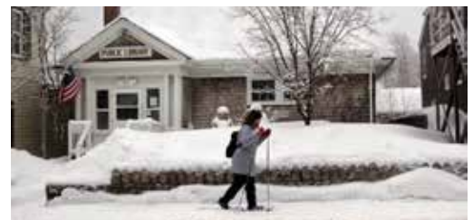
Snowshoeing in front of the Library.