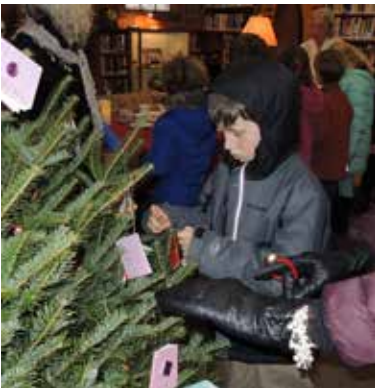
Young author decorates tree with tiny books