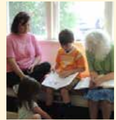
Summer Reading Program

The inciting incident for every Summer Reading Showtime short film is the individual response of a child to a piece of literature. Their impulses and creative decisions lead our team as we guide the young readers to adapt their book into a short film. Along the way, they learn about storytelling in performance, narrative structure, acting technique and filmmaking, all while improving their own literacy skills. The result is a series of films that feature imagination and spontaneity, with artistic proficiency and experience in an equal and complementary partnership.