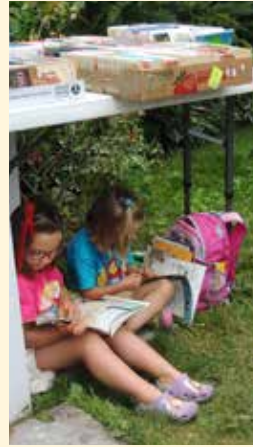
Kids find a quiet spot to read during the paperback sale