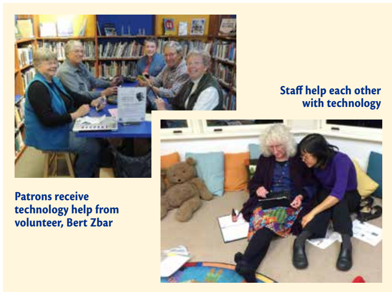
Staff help each other with technology