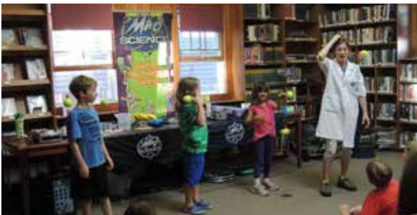
Mad Science of Maine