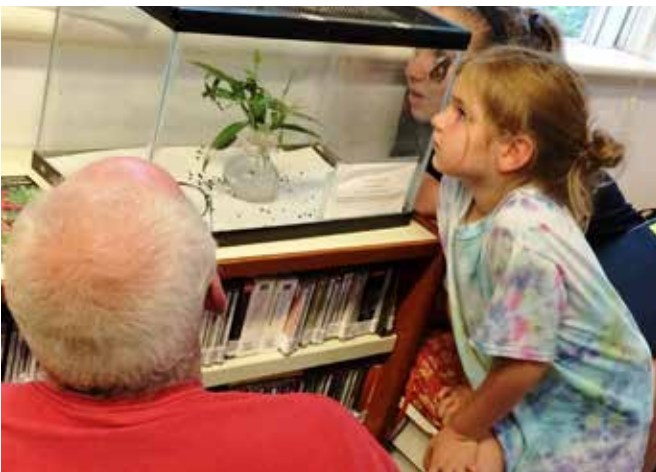
Marveling at the Library's monarch rearing and tagging program