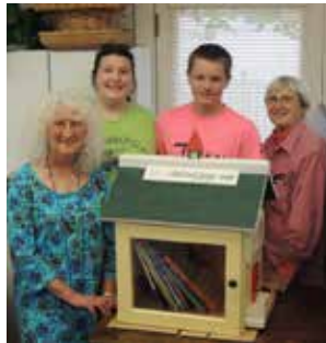
Volunteers built a little free library