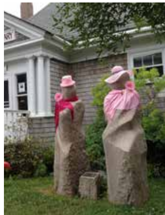
The "Sisters" dress up for the Quietside Flamingo Festival