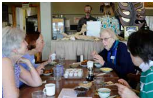
Friends enjoy conversation at the volunteer appreciation breakfast