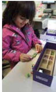
Little Bits technology