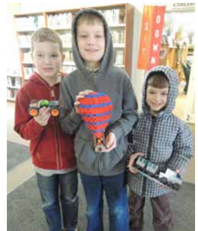
Inventors show off their Lego creations

Specific accomplishments of the children's program for 2015 have been mentioned elsewhere in this report, which gives me the opportunity to sing out about people on our team who star in their work of promoting and improving literacy.