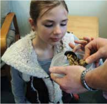
Chewonki Bug Show